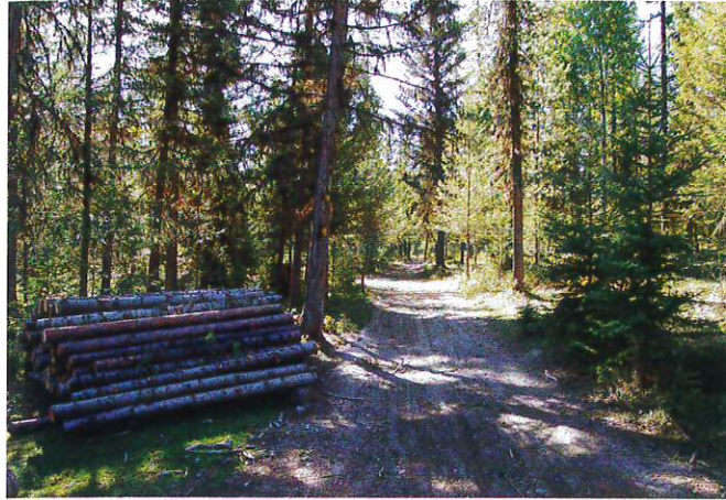
Careful planning and finding the help you need prior to harvest can make all the difference.

What are your goals? Do you want some financial return, wildlife habitat, nature appreciation, weed control, or something else? Talk to other landowners for ideas. Enroll in a Forest Stewardship Workshop to learn about forestry practices and develop a management plan. Work with the free assistance of the Tree Farm System or call your DNRC Service Forester to help you meet your long and short-term objectives. Forests can offer income opportunities other than timber sales. Honey, firewood, medicinal plants, and mushrooms are alternative sources of income.